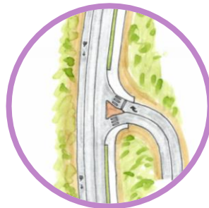
105 th Place Right-In/Right-Out