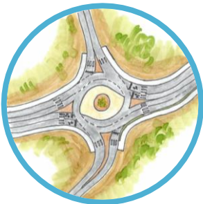
104 th Avenue Roundabout

Do you agree with our alternatives assessment and results?