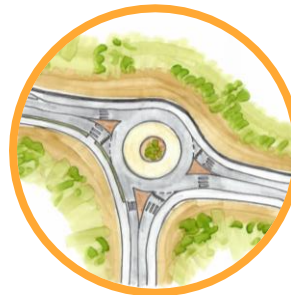
112 th & 116 th Avenues Single-lane Three-leg Roundabouts